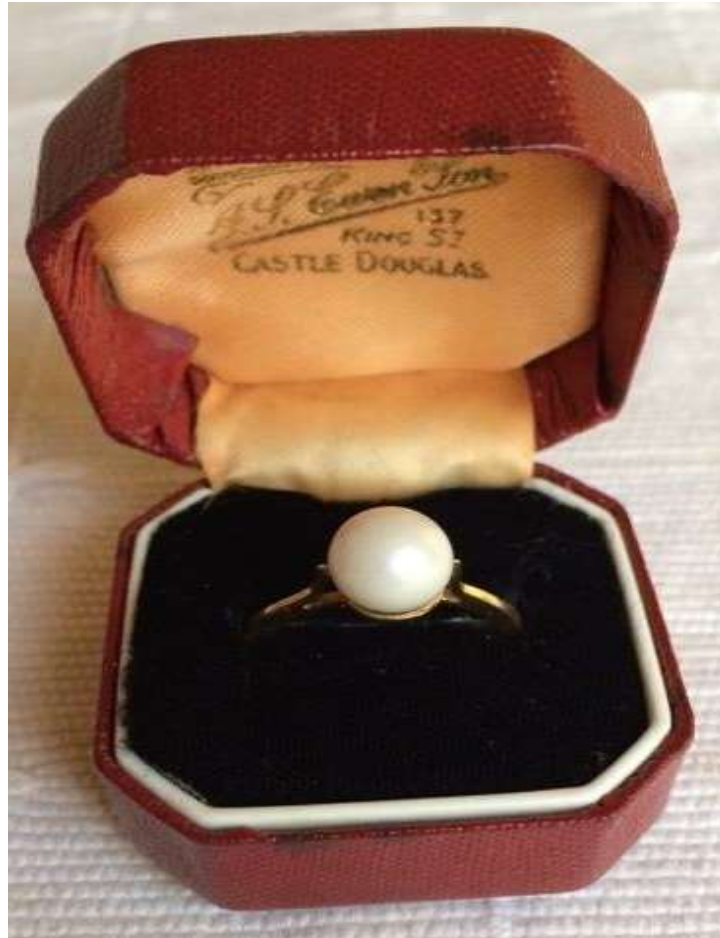
RIVER DEE PEARL